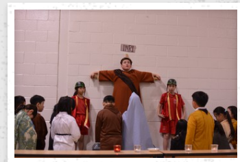
Passion Play - Crucifixion