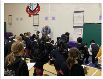
Stations of the Cross