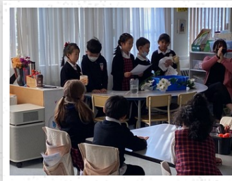
Grade 1 learn about Baptism