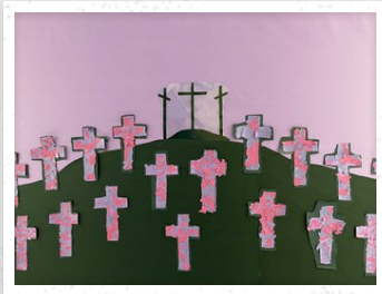
Beginning our Lenten Journey

Please see our website for more information, forms, and the school calendar.