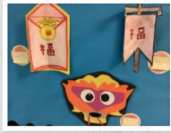
Happy Lunar New Year